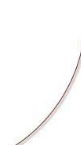
Strand of hair 100,000 nanometers diameter